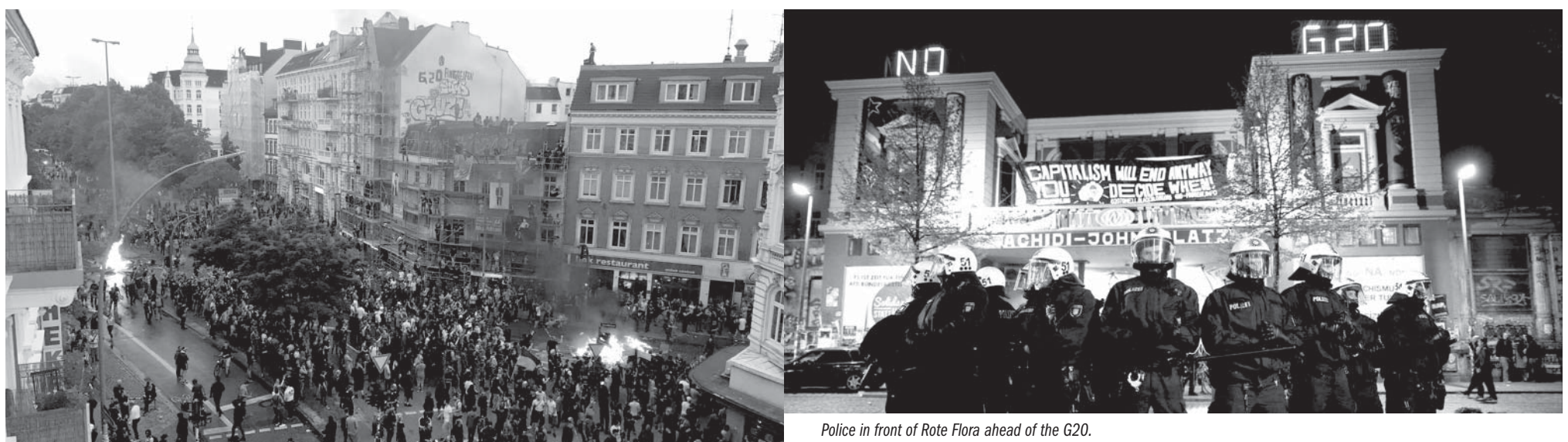
The burning barricades at the intersection of Neuer Pferdemarkt, Schulterblatt, and Schanzenstrasse.

There were hundreds of police charging back and forth at this intersection, but they were exhausted and stretched thin. When they switched out one squadron for another, we took advantage of the opportunity to rush across the street. Suddenly, we were on the other side of their lines, where courageous demonstrators had been keeping the water cannons at bay with a steady rain of projectiles.