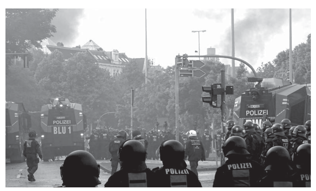
Schanze, police-free zone, on the horizon.

Germany appeared to be the last outpost of social peace in Europe, but it was boiling beneath the surface before the G20.