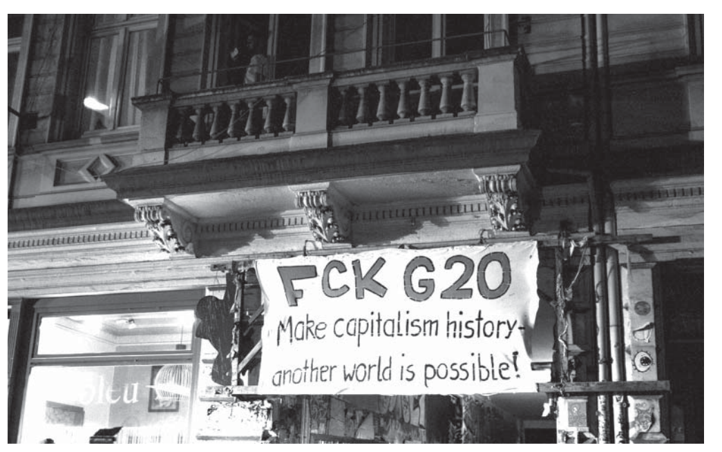
Signs like this hung all around St. Pauli ahead of the G20.

We ended up in front of a Greek restaurant in the Schanze neighborhood. The family that owns it is sympathetic to the demonstrations; the father is a communist, the son an anarchist. Demonstrators helped them move their tables inside as riot police begin to carry out charges down the street. This is typical for Hamburg: larger conflicts often spill over to this intersection, and the police always position a squad here.