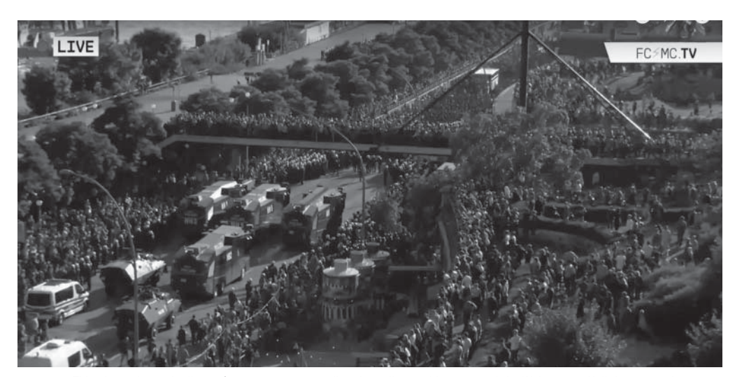
This photo shows the lines of spectators surrounding the police positions around the Welcome to Hell demonstration.

the lines of spectators—but every time they did, more spectators gathered to watch them. The police who had hoped to surround and isolate the radicals were themselves surrounded by society at large. As of that moment, the spectators were really just that, spectators: attempts to lead chants among them fell flat. But they were watching, and the police were watching them.