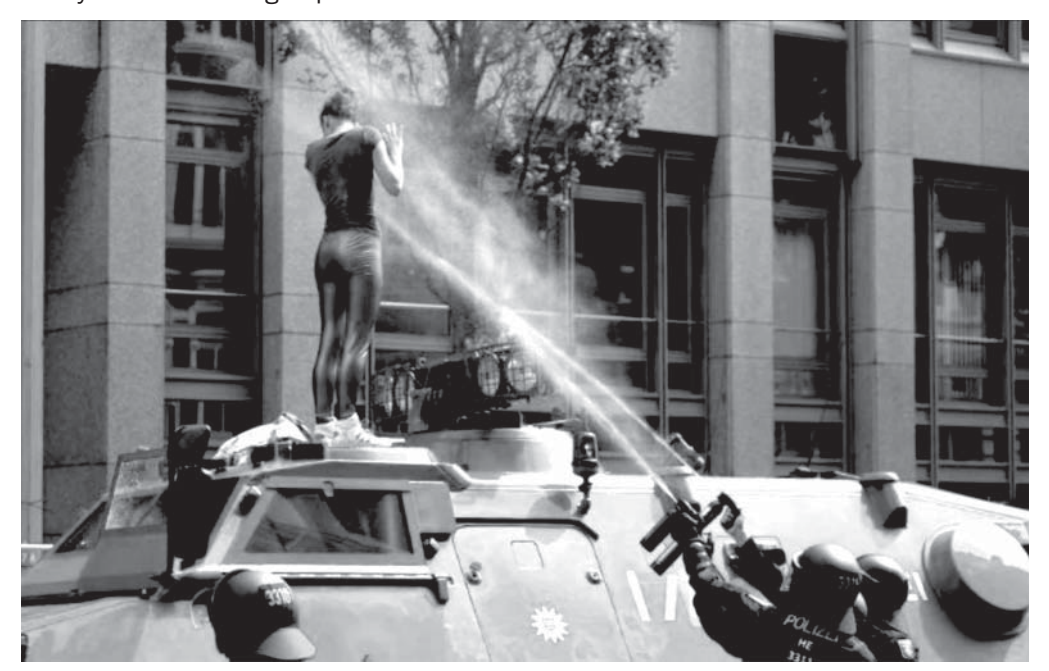
In response to creative blockading tactics, all the police could come up with was—more pepper spray.

Meanwhile, at a press conference at the media center at Hamburg's world-famous St. Pauli stadium, representatives of Welcome to Hell, Block G20, Solidarity without Borders, and other groups presented a unified front in condemning the previous evening's police attacks, emphasizing that it was only a matter of good fortune that the police had not killed anyone and declaring that the protesters would not be divided. When a journalist from the conservative media outlet NDR attempted to foment division by alleging that he had read criticism of the Welcome to Hell march on the Facebook page of another protest group, Right to the City, a representative of that group stood up from the audience and repudiated his insinuation, forcefully asserting their solidarity with the other groups.