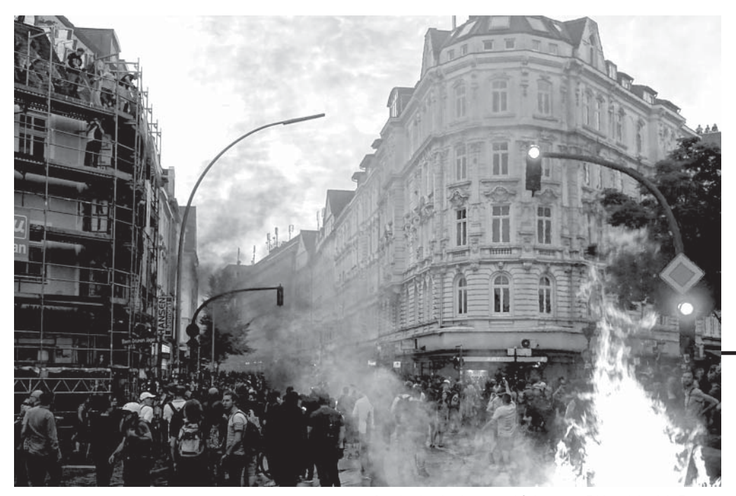
Burning barricades around Schanze on Friday night, July 7.

Bewilderment about the choice of the location created a tense atmosphere in the weeks before the G20, as stories spread about leftist radicals coming to burn down the city. One out of every twelve police officers in all Germany was to be deployed to Hamburg.