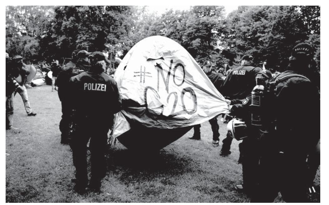
Anti-tent raid on Tuesday, July 4.

The police raid on Enterwerder Park and the unprovoked attack on the Welcome to Hell demonstration four days later fit seamlessly together: they are two examples of a single strategy. It was not about what happened in the foreground but the effects. The point was to discourage people from participating in the protests against the G20 summit. The attacks clearly had nothing to do with the behavior of the demonstrators; in retrospect, they appear choreographed. They attacked the camps in order to convey the impression that there were no safe places in Hamburg for out-of-town demonstrators to go.