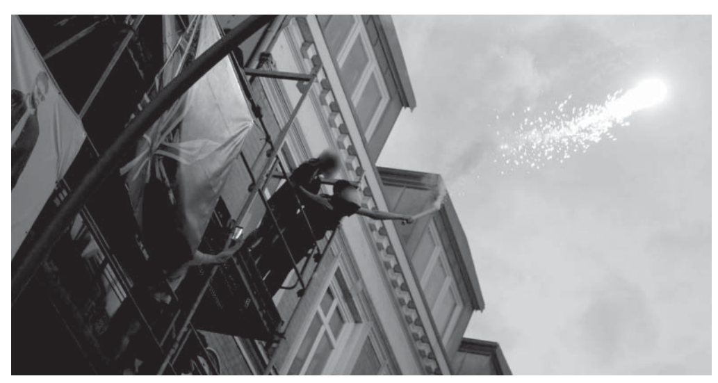
Celebrating in liberated Schanze.

camaraderie. Many businesses were open, packed with people buying falafel or drinks. As people lined the streets, cheering at the arrival of the bicyclists, it could have been a family-friendly festival. The vast majority of participants were not anarchists or foreigners from Southern Europe, but ordinary people from Hamburg who had turned against the police over the preceding week. Outside of Schanze, even in areas where there were no anarchists, locals pulled their own trashcans into the street, forcing the police to spread themselves ever thinner over more and more territory.