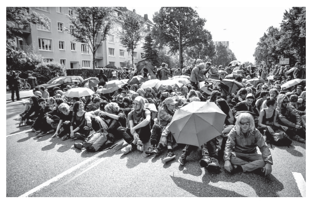
A blockade Friday morning.

at Landungsbrücken, Berliner Tor, Altona, and Hammerbrook. From there, they moved through the city in different directions, carrying out a variety of decentralized actions. Some came close enough to the location of the summit to stop delegates in their vehicles.