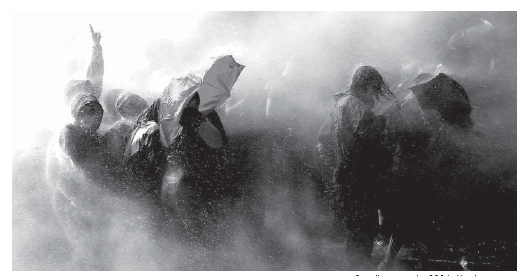
Standing up to the G20 in Hamburg.