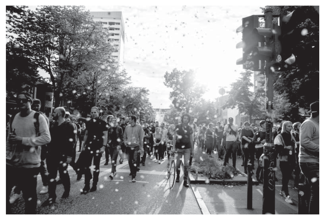
The mobile dance party on Wednesday, July 5

At the time, the police seemed unbeatable, though the locals were making an honorable effort to put up a fight. Little did we know that just three days later, we would watch a joyous Critical Mass of bicyclists pass through this intersection while barricades burned at all the access points to the neighborhood and Schanze was a police-free liberated zone.