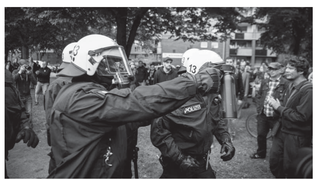
Police getting on well with the locals in Hamburg.

Next, the police presented a detailed media report on how they planned to treat prisoners, even taking journalists into the cells for a photo shoot. They