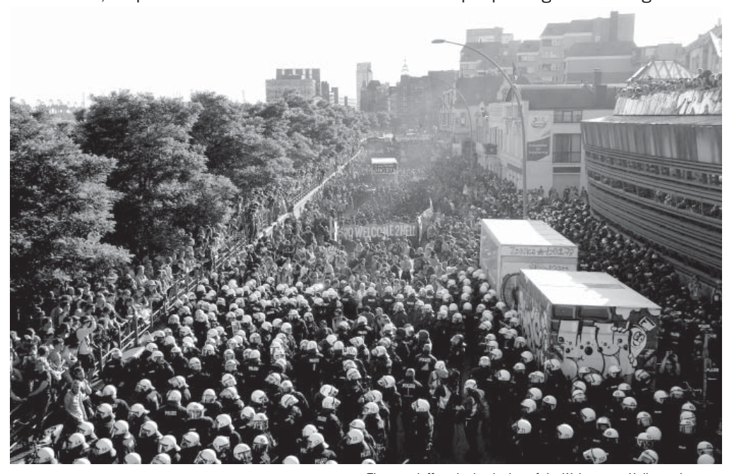
The standoff at the beginning of the Welcome to Hell march.

Around 5 pm, while people were listening to speeches and concerts at the fish market, a spontaneous demonstration of over 500 people began marching