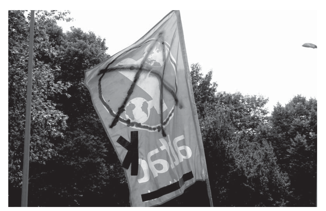
A sign of the times.

Another conservative journalist accused the panelists of "propaganda" for attempting to tell the story of how the police initiated violence the preceding night. It's a safe bet that he never raised his hand in a police press conference to accuse the police of propaganda, despite the blatant lies that the police spread about the number of injuries suffered by officers at the G20.