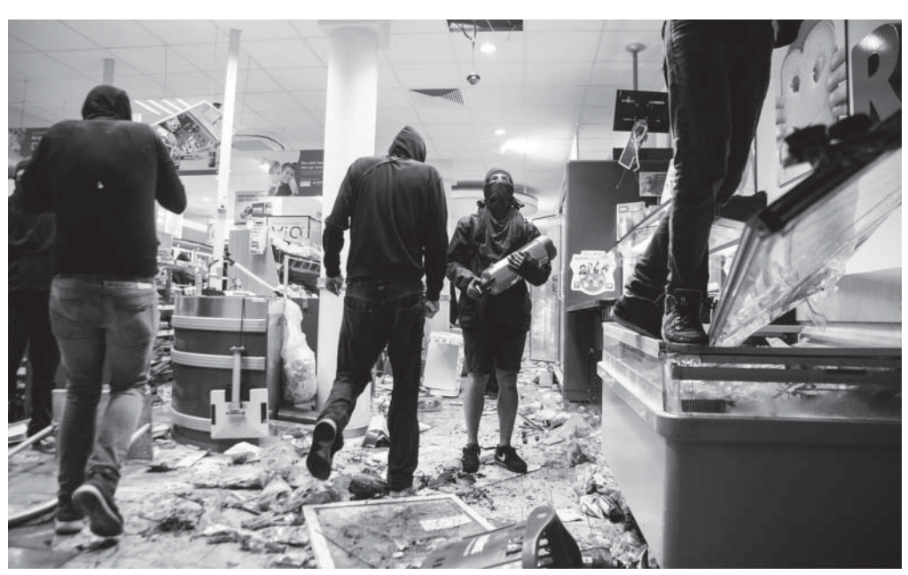
Everything for everyone: demonstrators looting one of the few shops in Schanze that didn't put up a sign expressing opposition to the G20.

"In the US, there would be no ambulance," I explained.