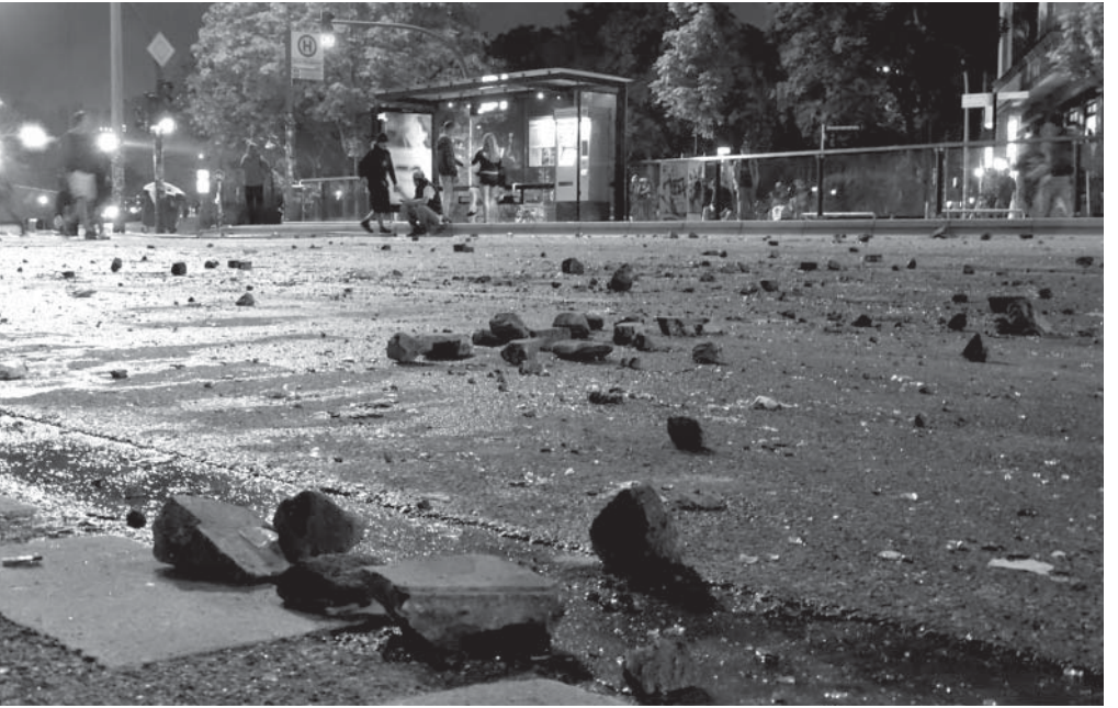
The aftermath on Friday, July 7.

The events of Berlin May Day in 1987 and the 2017 G20 both illustrate a police strategy reaching its limits.