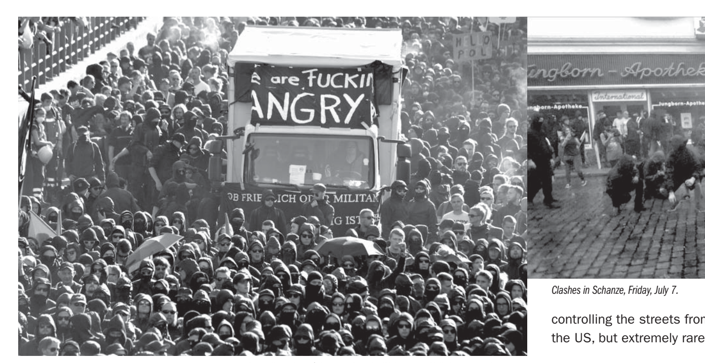
A small portion of the crowd at the Welcome to Hell demonstration.

The news told a different story: "About 220 officers from Berlin were released from duty by the Hamburg authorities after they threw a wild party that involved public sex, brawling, urinating in a group, and a bathrobe-clad officer strip-dancing with her service weapon."