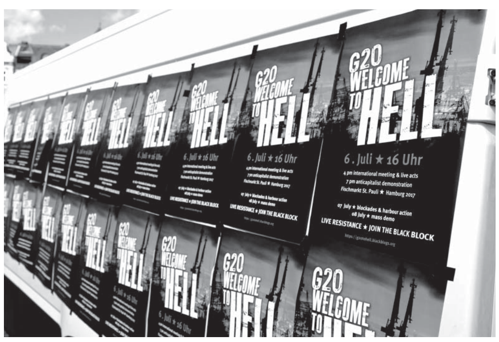
Welcome to Hell posters blanketed Germany for months before the G20.

After the attack on the Welcome to Hell march, we found a way out of the demonstration and went to a safe room on the Hafenstrasse to treat everyone from our group who was suffering from pepper spray. We didn't want to give the