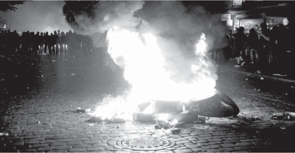
The rebellious streets of Hamburg.

Later, we should do more to identify the strategies and objectives that guided the authorities in Hamburg—and to refine our own strategies and objectives.