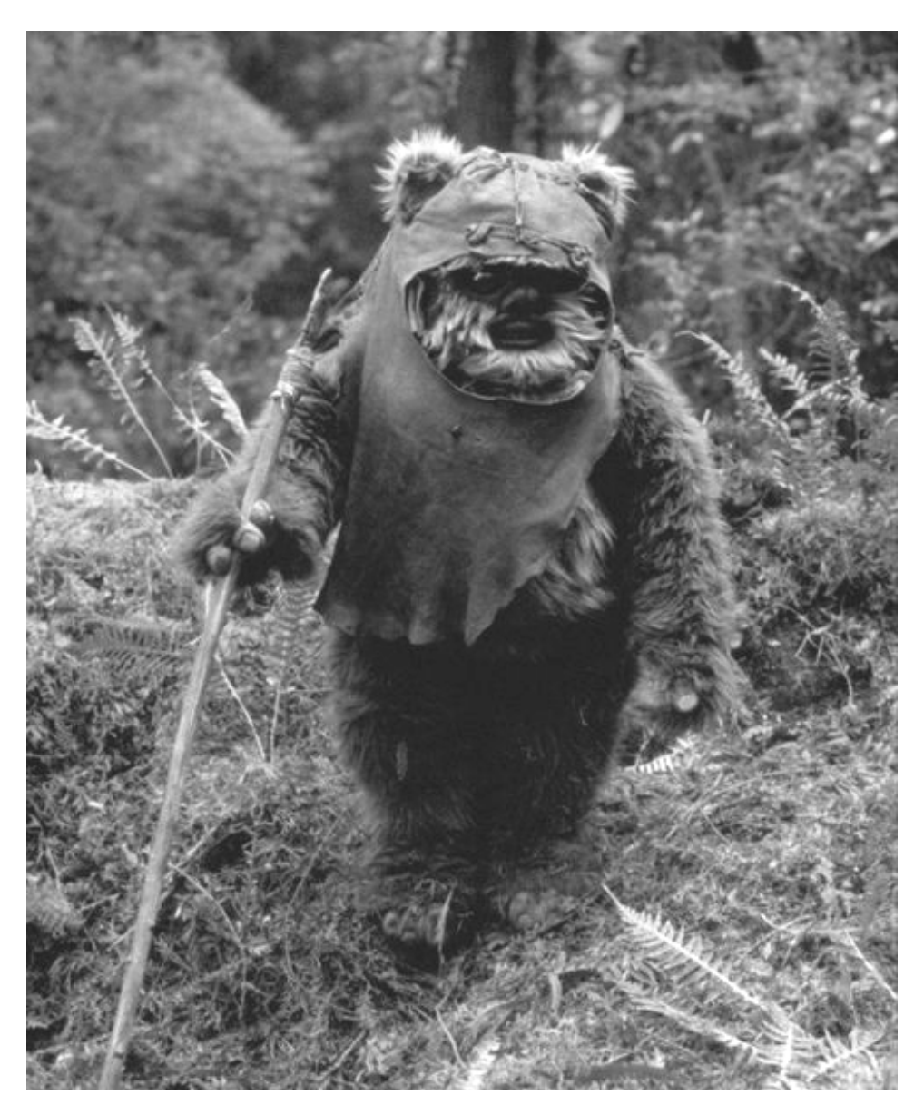
Earth Warriors are OK! a resource guide for combating the Midwest Green Scare and Other State Repression